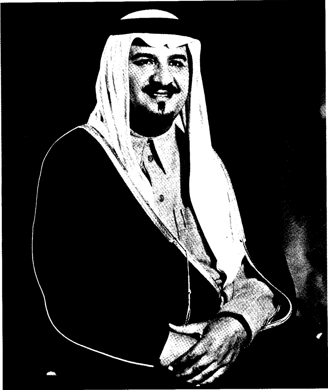
His Royal Highness Prince Sultan bin Abdulaziz Second Deputy Prime Minister and Minister of defense and Aviation and Inspector General