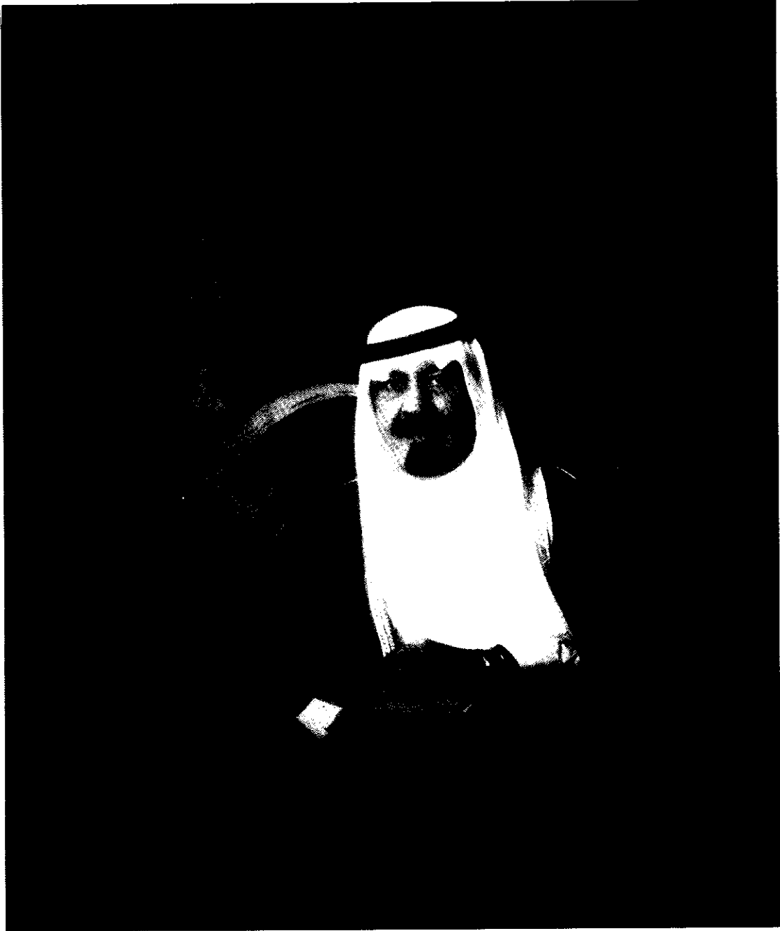
His Royal Highness Prince Abdullah bin Abdulaziz Crown Prince and Deputy Prime Minister and Head of The National Guard