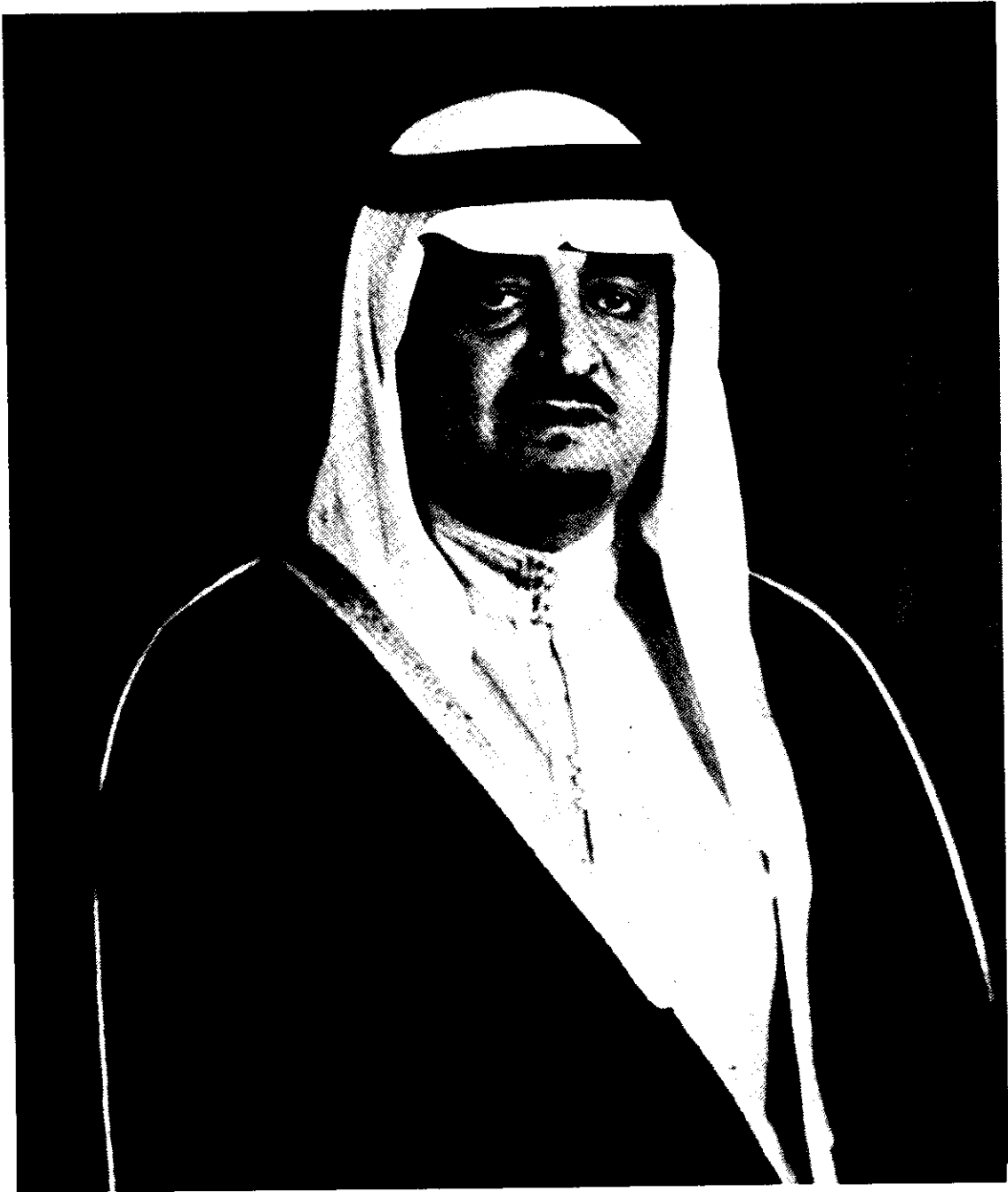
Custodian Of The Two Holy Mosques King Fahd Bin Abdulaziz Al-Saud