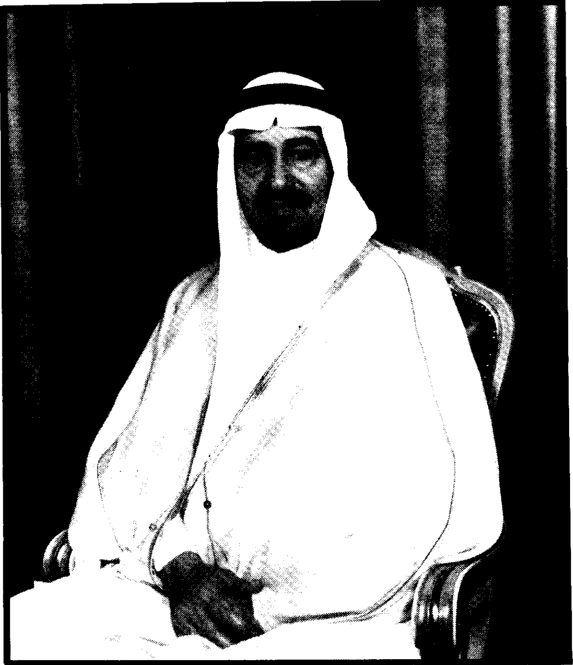
HIS MAJESTY KING KHALED IBN ABDUL AZIZ